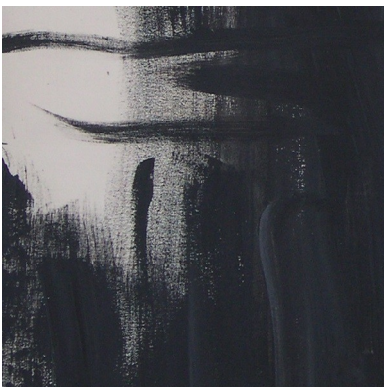
"Murder In The Streets"

.. And my people's empire I rebelled against collapses in a plague, while its royal soldiers rage with murder in the streets.