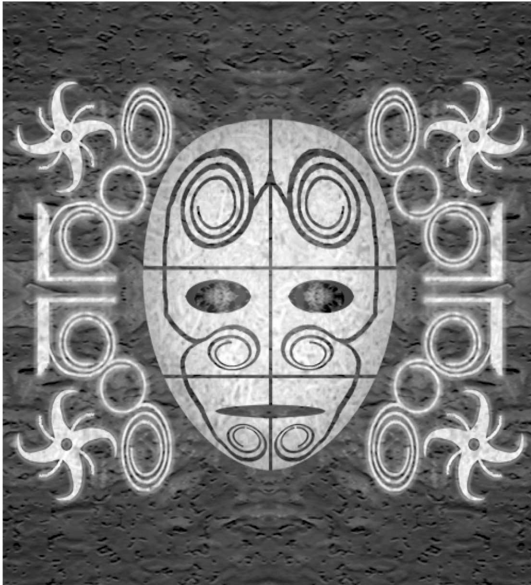
Telling The Tale Digital Image by Stone Riley