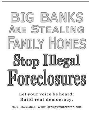
Big Banks Are Stealing Family Homes Stop Illegal Foreclosures Let your voice be heard: Build real democracy.