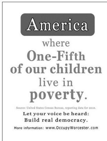
America where One-Fifth of our children live in poverty. Source: United States Census Bureau, reporting data for 2010. Let your voice be heard: Build real democracy.