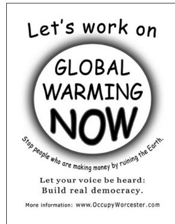
Let's work on Global Warming Now Stop people who are making money by ruining the Earth. Let your voice be heard: Build real democracy.