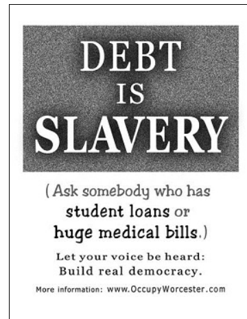
Debt Is Slavery (Ask somebody who has student loans or huge medical bills.) Let your voice be heard: Build real democracy.