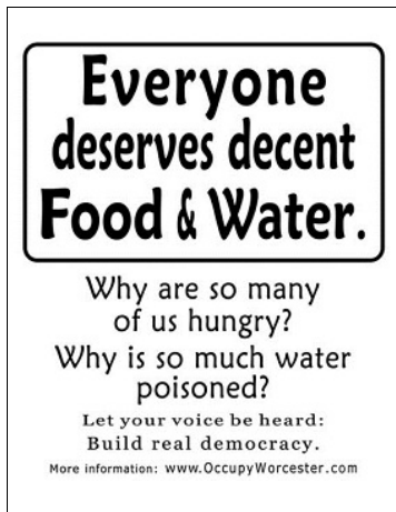
Everyone deserves decent Food & Water. Why are so many of us hungry? Why is so much water poisoned? Let your voice be heard: Build real democracy.