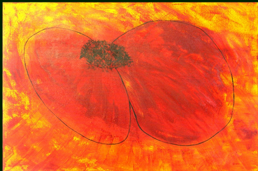
Nine Of Fire Life, subtle and vigorous, denies all obstacles. "Poppy" 24in. X 36in.