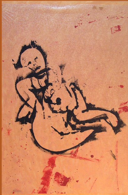
Nine Of Air Despair and misery, for all seems lost. "Catherine The Great" 36in. X 24in.