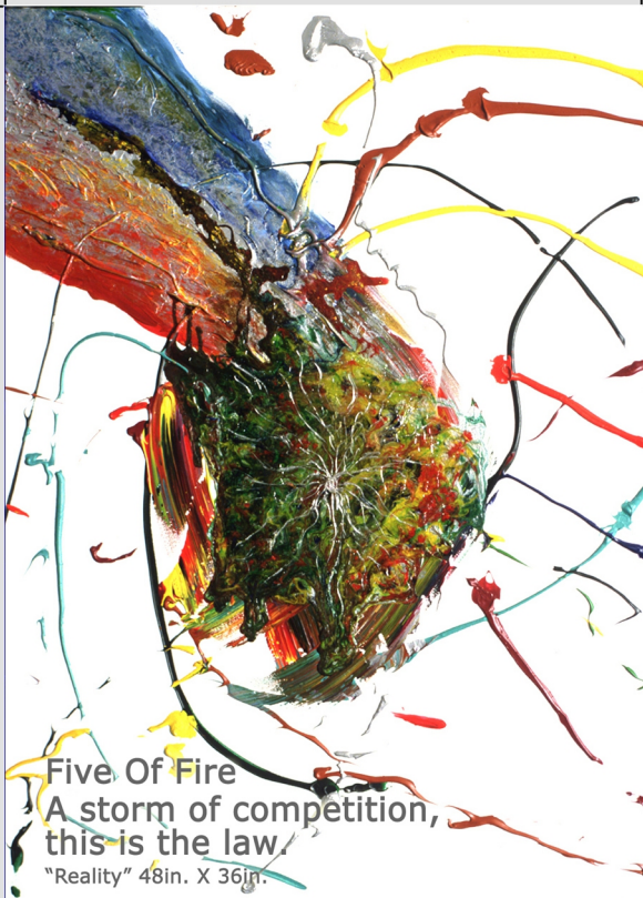
Five Of Fire A storm of competition, this is the law. "Reality" 48in. X 36in.

Spirit Hill Tarot Print Sheet #05