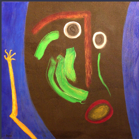
Five Of Air Honor stands shattered, real self is exposed. "John The Baptist" 22in. X 22in.