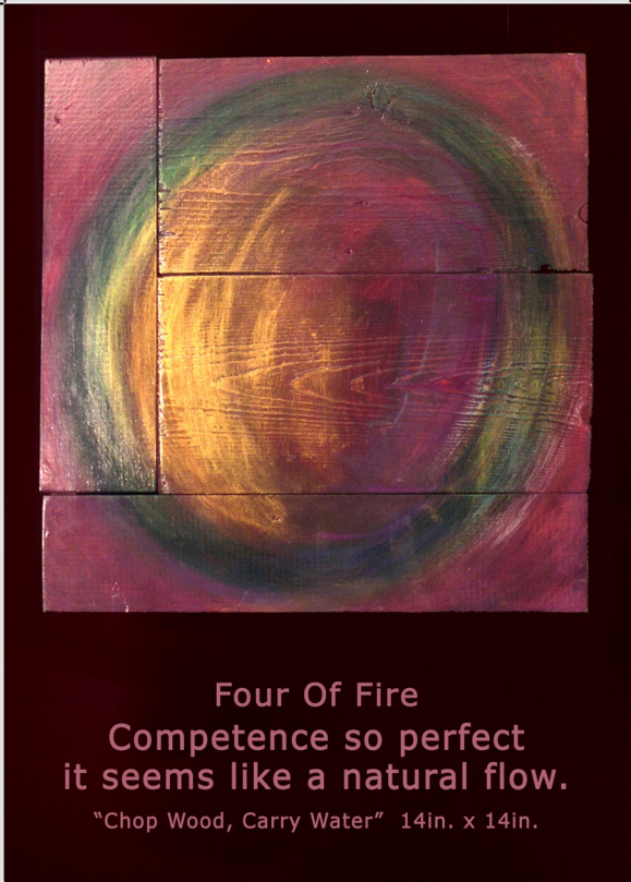
Four Of Fire Competence so perfect it seems like a natural flow. "Chop Wood, Carry Water" 14in. x 14in.