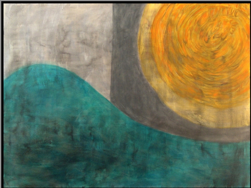
Three Of Fire Fruitful partnership.

Spirit Hill Tarot (C) 2005 Stone Riley Print Sheet # 03