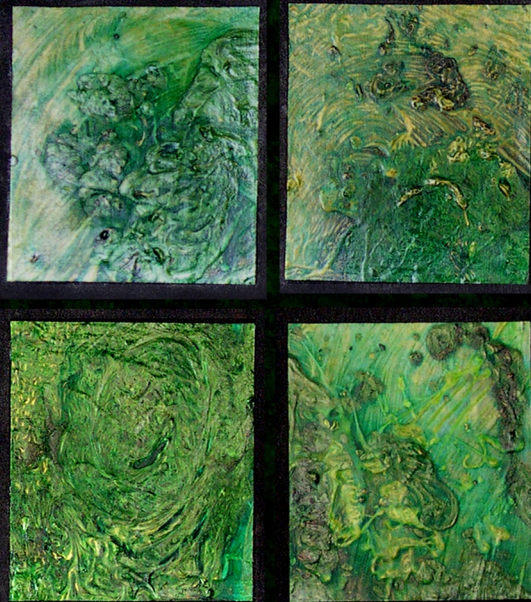
Three Of Earth Material Increase

"Islands Of Dream" (four details) Each segment about 11in. X 8in.