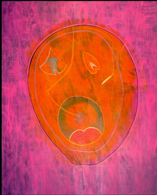
Three Of Air "Agony Of Love" 60 x 48 in. Catastrophe; the bonds of the human heart are burst.